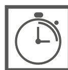
QUICK TO INSTALL