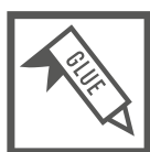
INSTALLATION WITH GLUE