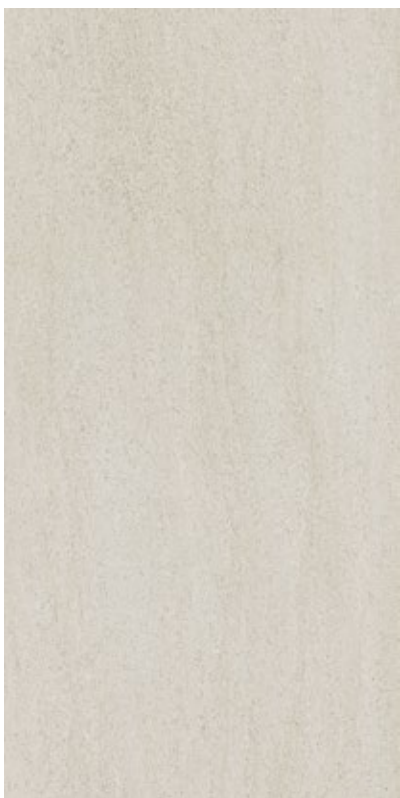
MINERAL LIGHT GREY